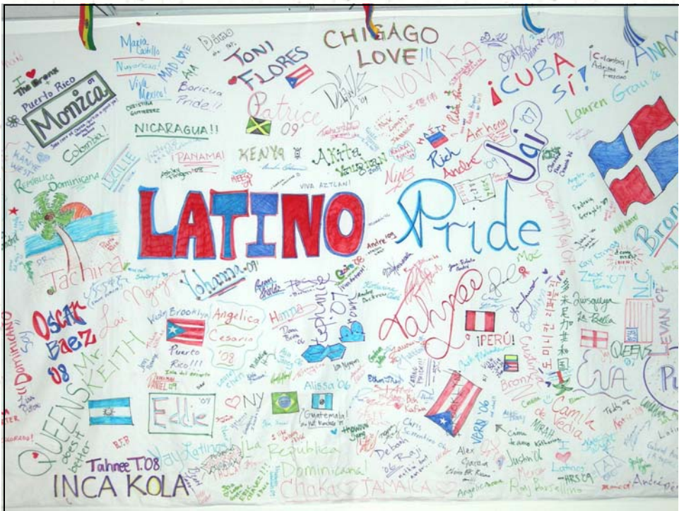
2005– 2006 Latino Pride Banner signed by the Amherst College community to usher in Mes Latino