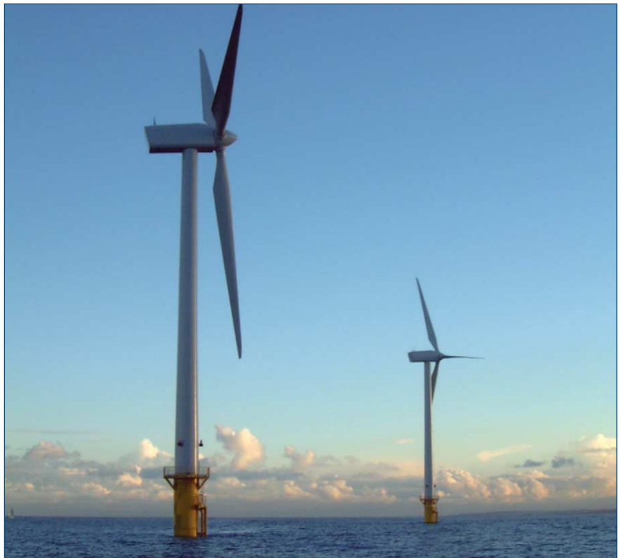
Blyth offshore wind farm: the first in the UK.

caisson placed on the seabed to support the WTG; and the monopole foundations, which are either prefabricated steel or concrete pile systems driven or augured into the seabed. The gravity foundation system has been used for several European WTG installations where the soil or rock characteristics at the bottom preclude the use of monopoles. It requires a shipyard and dry dock near the site to construct and allow the foundation structures to be floated out to the site and sunk. It is an environmentally more "brutal" system due to the foundation structures' large diameter. The monopole system is the best suited and preferred solution for offshore applications being a large diameter pile driven 15.2m to 27.4m into the seabed, depending on the load bearing characteristics of subsurface marine sediments. At Nantucket Sound the main support tower will have a base diameter of