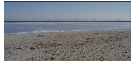
Computer simulation of a view from the shore about 10km away from the Nantucket Sound wind farm (from a place called Cotuit)

There are two basic foundation systems for existing offshore wind turbines: the gravity based foundations, which use a prefabricated, large diameter concrete and steel