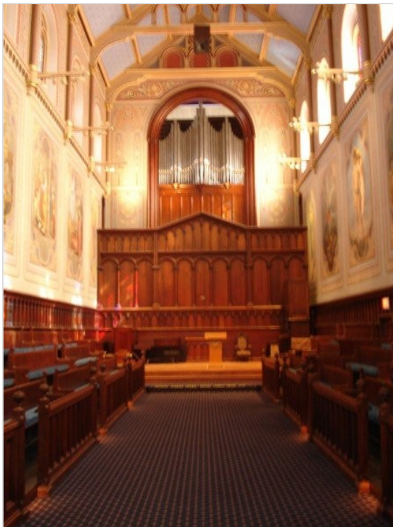
Bowdoin's recently restored chapel, complete with new organ

building includes a large rehearsal room, nine practice rooms and plentiful lockers downstairs, as well as a green room for student and visiting performers. The entire building is soundproofed; Mr.