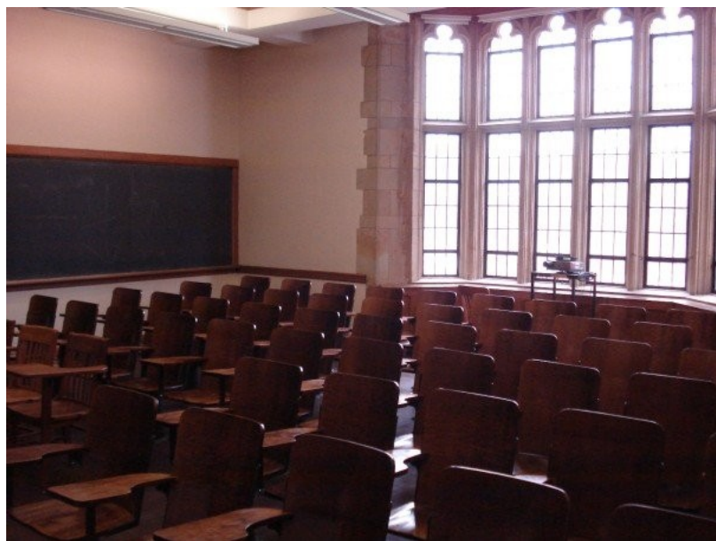
A music classroom in Harkness Hall