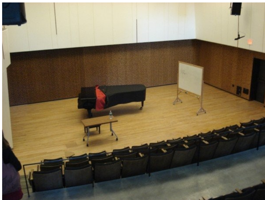
The interior of the renovated performance hall

first Brown students to give a performance in the new space. The Fulton rehearsal wing was improved along with Grant Hall, creating a new large group rehearsal space. Also attached to this complex is the Morrison-Gerard wing, which provides five practice rooms for students and houses most music lessons. A block away is the Steiner Building, devoted entirely to music practice. On the ground floor, there are thir-