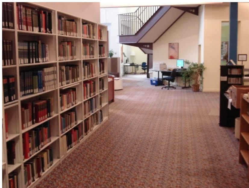
The 2-level music library in the CFA