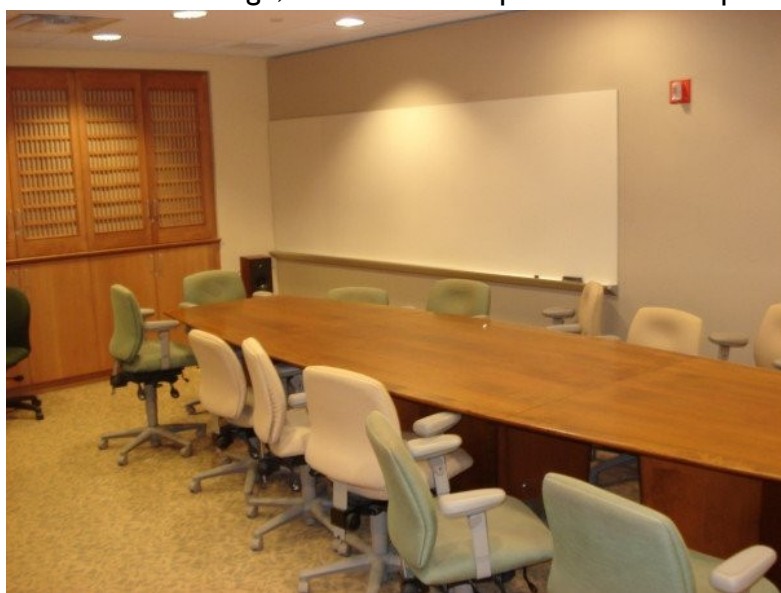
A seminar room shared by the School and Department.

brand new space houses what McCreless praises as one of the two or three best libraries in the country, and its contents are available to graduates and undergraduates alike. A few seminar rooms in the library are also open to both the school and the department, but most undergraduate music classrooms are in the restored Harkness Hall.