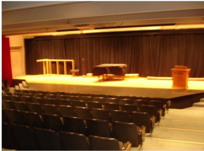
The 270-seat Kresge Auditorium was once a main venue of the Music Department, but since the construction of Studzinski, this hall will be made available for student uses.

With 1,600 students, Bowdoin is an excellent comparison to Amherst in almost all musical areas. Students looking for a small, elite liberal-arts education are likely to investigate both schools. The department sizes and student performance groups at Bowdoin are very similar to Amherst's. But like Middlebury, Bowdoin's investment in the arts is much more visible than is ours. During our visit, we saw two brand-new theater spaces, a $15 million music performance hall, and a recently renovated music classroom building complete with a performance hall and new electronic music studio. Visiting students will find no such investments on our campus, and will instead notice the poor quality of our facilities available to both produce and perform music. This fact, combined with the actions of the pro-arts administration at Bowdoin, make the school a serious competitor for the musically-inclined students that Amherst hopes to attract.