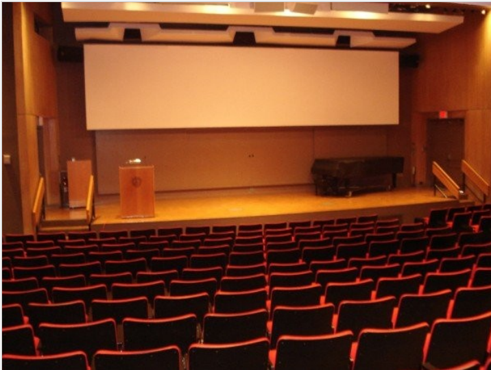
Brooks-Rogers Hall (above) and the Centerstage (right), two additional performance halls on Williams' campus.