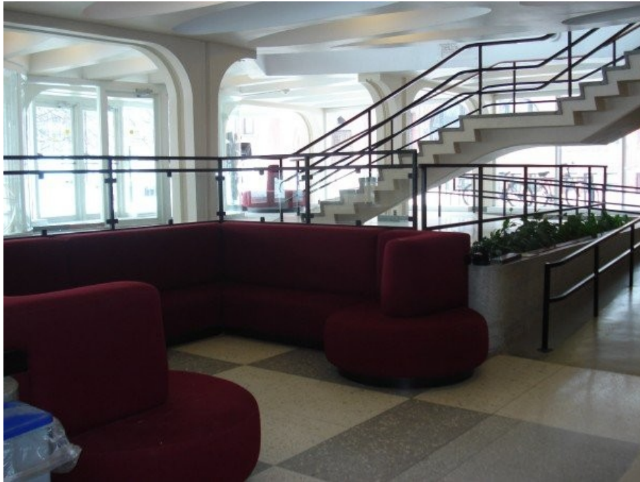
The Main Entrance to "The Hop" doubles as a lounge and lobby for the Moore Theater.