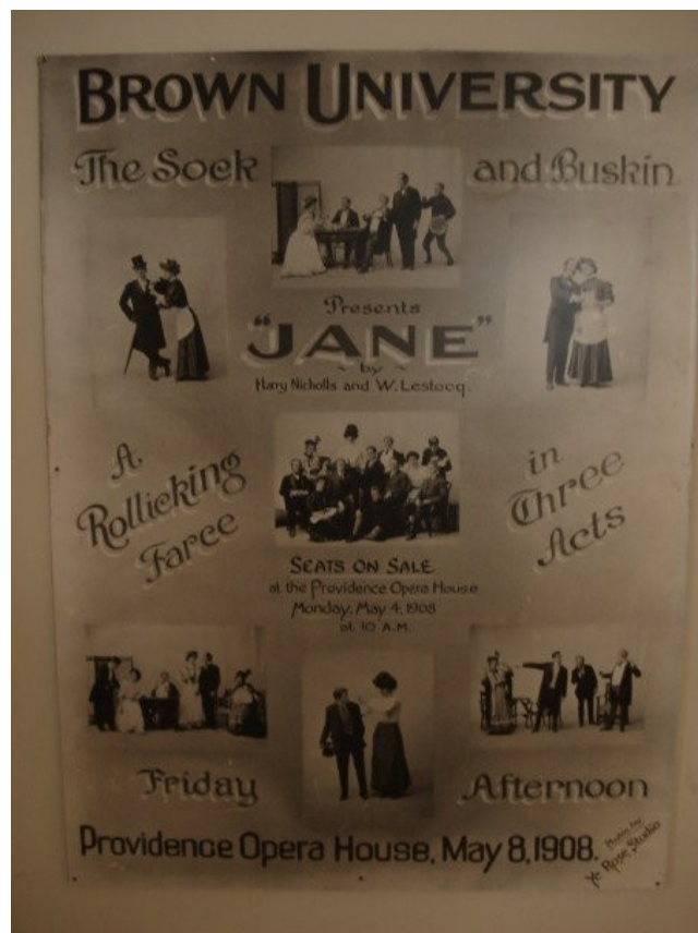
Student theater at Brown has a long history- this poster for a student production dates to 1908.