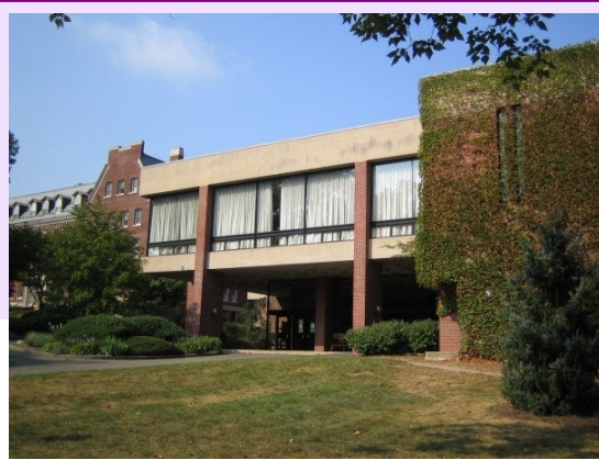
Arms Music Center

So it is with interest both in our own musical careers and the future well-being of the "Singing College" that we have compiled this report on our music center and the music facilities of our peer institutions.