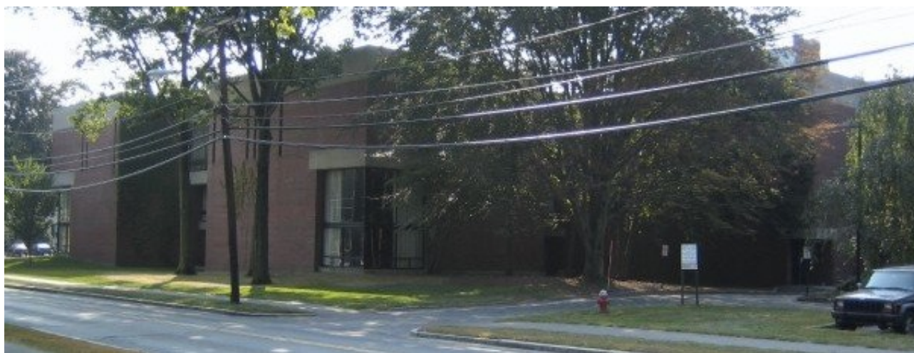
The view of the Arms Center from Route 9 shows its unwelcoming facade. Only one window in the entire structure is prominent. The rest of the building serves as a massive brick wall between campus and the town.

The rest of the building has similar problems. Furniture throughout is worn out, including the chairs in the Green Room that hosts many world-class musicians. The floor is old and creaky in several parts of the building - simply walking up or down a staircase betrays the building's poor