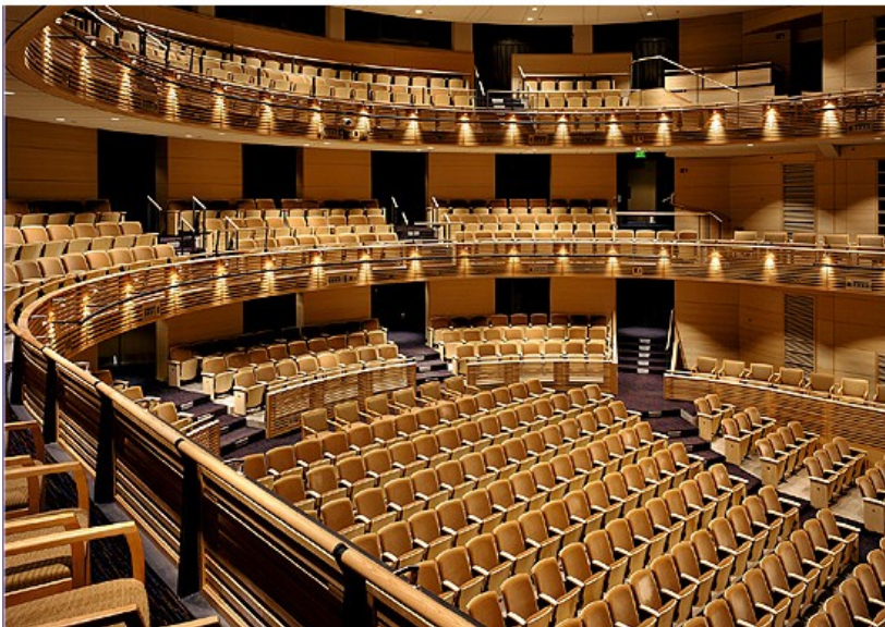
The 550-seat Mainstage in the brand new '62 Center

Performance space at Williams is much more varied than at Amherst. The small Brooks-Rogers Recital Hall in the Bernhard center hosts smaller, intimate concerts like recitals and chamber music. Larger concerts are presented in the magnificent 100-year-old Chapin Hall next door. The venue's large capacity gives it flexibility; seats have been removed to accommodate a growing or-