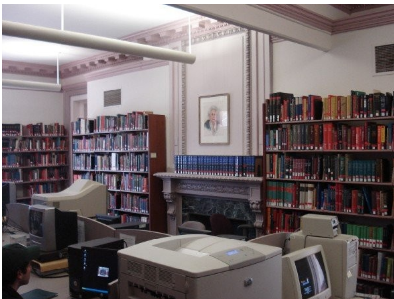
One of the several rooms that make up the Brown Music Library, praised by students for its sizeable collection.

The century-old Orwig building, containing the music library, is the main music building on Brown's campus. Hannah Lewis, a senior and library employee, praises its collection as incredibly large and comprehensive. "Everything I've ever wanted, they have multiple copies of," she said. Multiple levels house computers, stacks, and some of the nicest study areas on campus. There is a separate collection of rare and historic music housed across campus in the Hay Library. The rest of the building houses professors' offices, classrooms, and other academic music facilities.