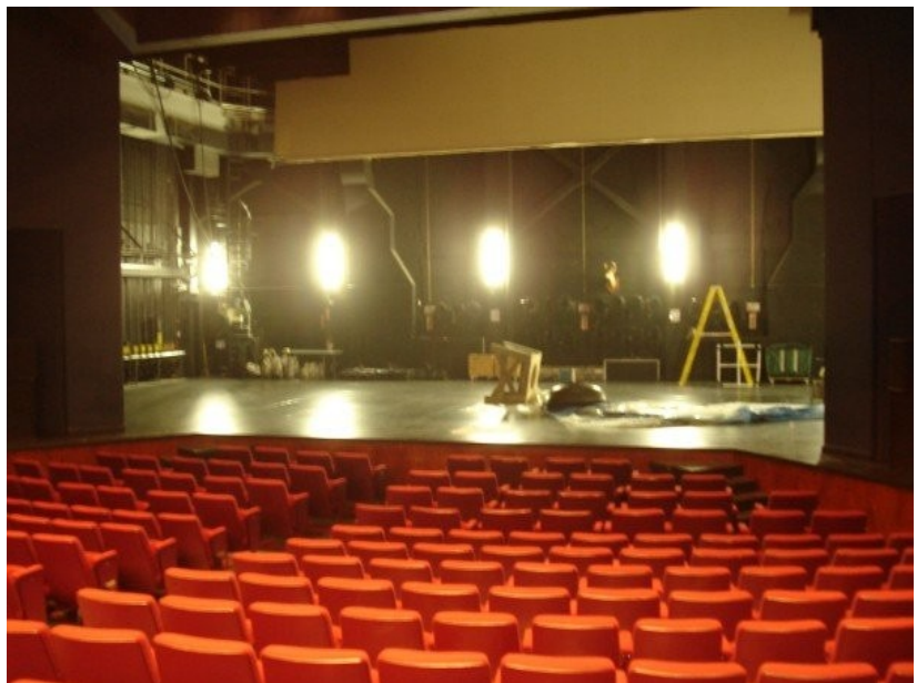
Inside the 480-seat Moore Theater

Though the music department itself has not been renovated since 1962, the building has undergone extensive aesthetic and functional renovation in its hallways and performance spaces (including the addition of a cafe), creating a beautiful, modern building capable of supporting the entire college's arts programs. In fact, in 1988 the National Endowment for the Arts named the Hopkins Center one of the nation's best performing arts centers. Aside from the 11 practice rooms, the music