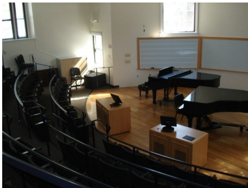
Tollitson Hall, renovated with most of the building, seats 68. In addition to performances, it also is home to lecture classes as well as choral rehearsals.