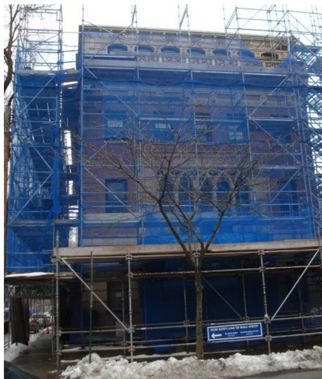
Stoeckel Hall, currently undergoing renovations, will replace the Elm Street building in 2009, and become one of several brand new music facilities on campus.

Professor McCreless admitted that Yale suffers from a lack of practice space, which can hurt individual students or a cappella groups looking to rehearse. But the construction on new and planned buildings all across Yale's campus is evidence of an