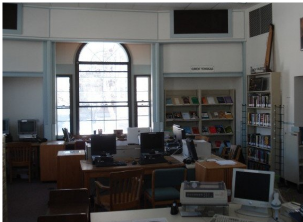
Bowdoin's music library, in Gibson Hall