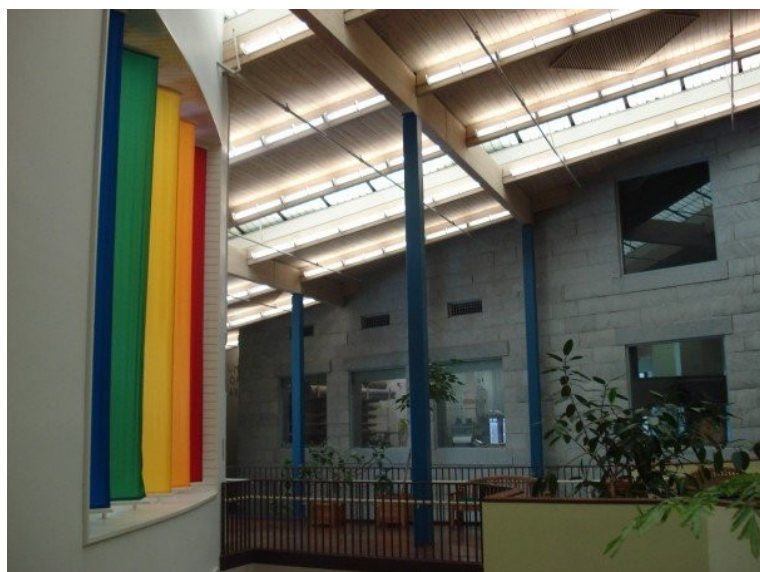
The attractive, airy atrium of the CFA occupies much of the building. All of the main venues, as well as academic areas, study space, and the cafe, are accessible from this central space.

conducted an interview for a new full-time choral conducting position, reflecting the renewed emphasis on the choral program at the college. The Middlebury Orchestra has been growing and the conductor is also developing an extensive chamber music program. The jazz band, which had been a student-run group, and therefore inconsistent from year to year depending upon student interest and leadership, is now an official part of the Music Department.