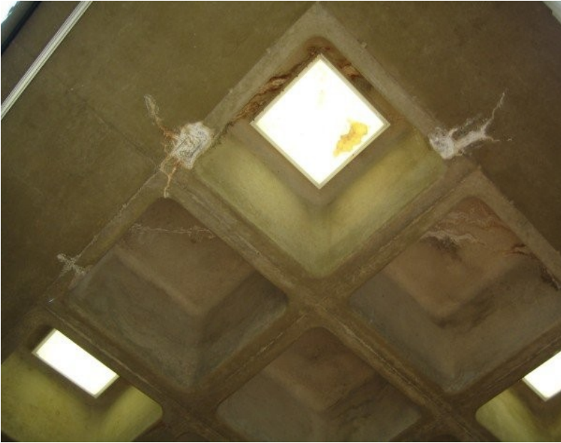
Water damage to the ceiling and floor from a leak in the choral room has sat without repair for years, another sign of the apparently low priority placed on maintenance of the Music Center.

bleeds through loudly enough to impair the activities of students. Vocalists often describe the difficulty of competing with an instrument next door, while louder musical instruments, such as brass, can bleed through the walls to disrupt classes. Given the lack of rooms available even under the best circumstances, it is even more unfortunate that many become useless simply because of this oversight in their original design. Amplified instruments can be heard throughout the entire building no matter where they are being played.