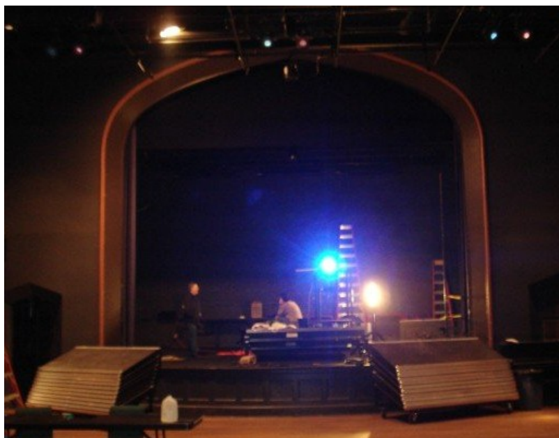
Students at work on and independent production in the '92 theater.

Additionally, many performance opportunities are offered through the department. An opera class is offered each semester; the most recent one performed Act II of Die Fledermaus . The department offers classes in an amazing array of music, including lessons in Balinese, Japanese, and Javanese instruments. Incredibly, the CFA has rooms specifically designed for and devoted to the practice of these instruments.