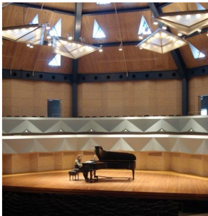
The concert hall in the CFA accommodates both intimate recitals and larger performances. Students, like this one, have extensive opportunities to rehearse in the hall before upcoming events.