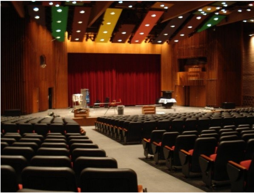
The 900-seat Spaulding Auditorium, the largest in the Hopkins Center. Spaulding hosts large orchestra concerts as well as smaller performances by student ensembles. It is also equipped for film screenings.

Though the music department itself has not been renovated since 1962, the building has undergone extensive aesthetic and functional renovation in its hallways and performance spaces (including the addition of a cafe), creating a beautiful, modern building capable of supporting the entire college's arts programs. In fact, in 1988 the National Endowment for the Arts named the Hopkins Center one of the nation's best performing arts centers. Aside from the 11 practice rooms, the music department has a recording studio that is accessible to individual students as well as a cappella groups. The department also houses the Bregman Electronic Music Studio, a space available to students interested in electronic composition and research. The chorus practices in Faulkner Recital Hall (bigger than but comparable to Room 3), and the orchestra practices in a large classroom. This classroom, as well as the one below it, used to be one large room, but was divided into two rooms to accommodate increased class sizes and offerings. Though the rooms are not acoustically separate, the department seems satisfied with the additional space.