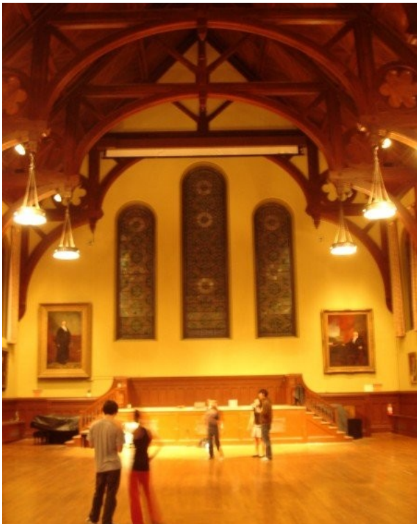
Alumni Hall, home to orchestra rehearsals, concerts, and occasional ballroom dancing lessons.