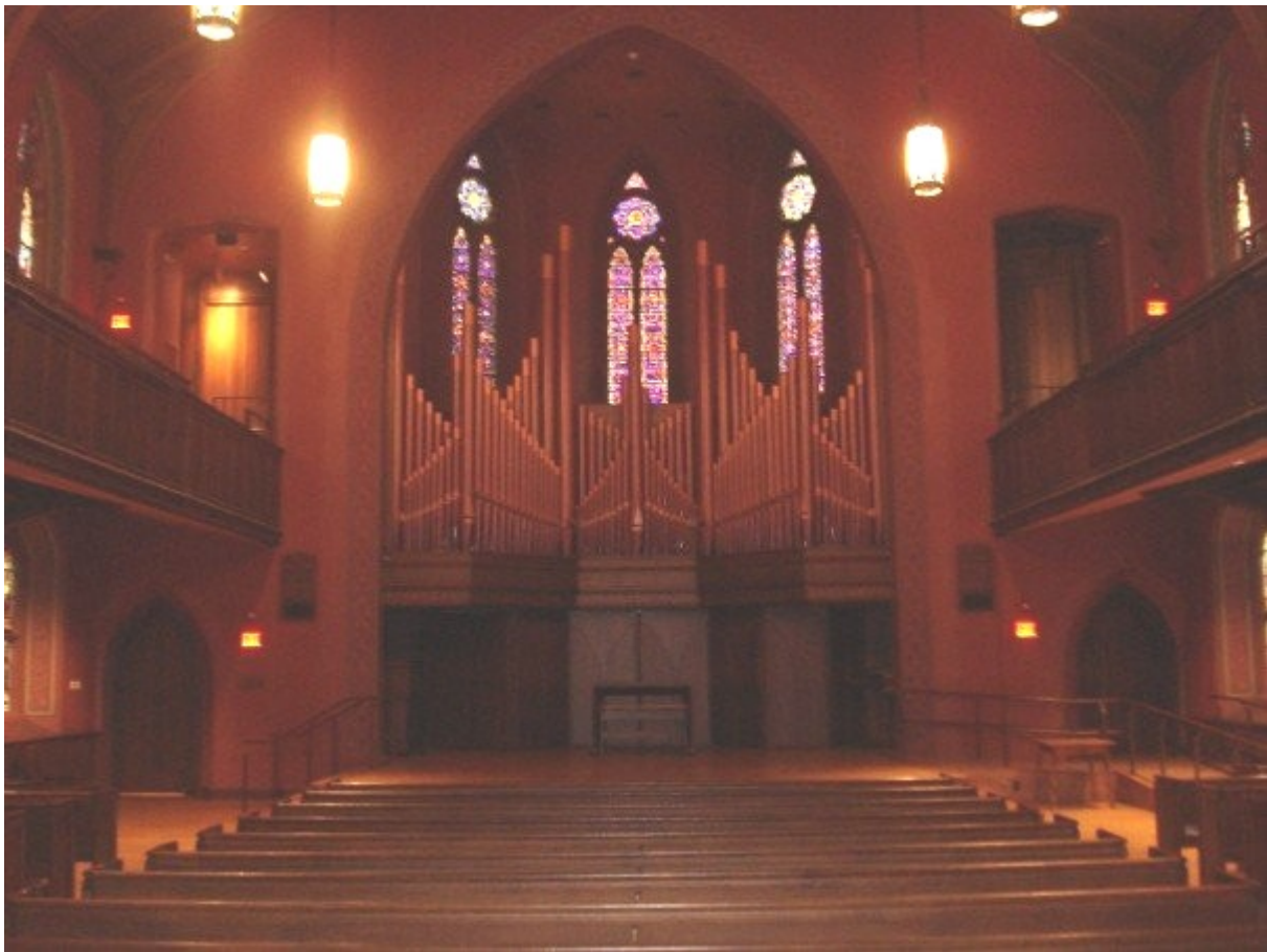
The Wesleyan Chapel interior.

our host, shared plans for renovations to the World Music Hall to fix the drone of an air conditioner. When we entered the hall, the noise was barely audible, but the interference of the HVAC unit was still important enough to Wesleyan to invest considerable money in its repair to improve the acoustics of the hall. Also planned in the next five years is a World Music Museum which, though it will not add to practice or performance space, will help to solidify Wesleyan's position as one of the top schools in the country for the study of ethnomusicology.