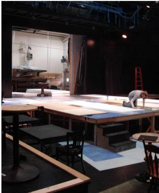
Students at work in the CFA Black Box on their production of Cabaret