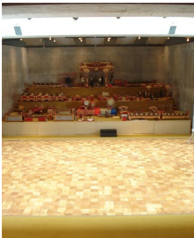
World Music Hall, with Wesleyan's gamelan. The hall hosts all types of concerts, not just ethnomusical ones.

The theater department sponsors two shows a year, one of which can be a musical. The music department sometimes produces musicals as well, which go up in the school's main theater. The '92 theater also contributes to the performance scene on campus, and does so independently of any academic department.