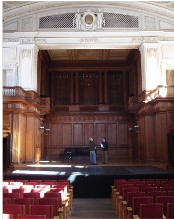
Chapin Hall, the college's largest, seats over 1,000, allowing for big crowds as well as flexibility in performance. Seats were removed when the stage was enlarged, but plenty are left for major concerts.

Practice rooms, on the first floor of the building, had just received a facelift including new paint and carpeting. Professor Bradley Wells, our host at Williams, stated that he felt the 25 or so rooms were adequate for the campus, and was shocked to hear of the lines that form when Amherst students must scramble for rooms. Practice rooms are acoustically separate and plentiful enough to share with the independent a cappella groups on campus. The building houses two classrooms and large choral and instrumental rehearsal rooms. Also in Bernhard is the large electronic music studio/piano lab, with several different stations to allow multiple students to work at once. Off-site, in the main Sawyer Library, is the department's music library. Wells credited its comprehensive collection with helping to keep faculty at the college, and believes that it entices many serious music students and faculty to the college.