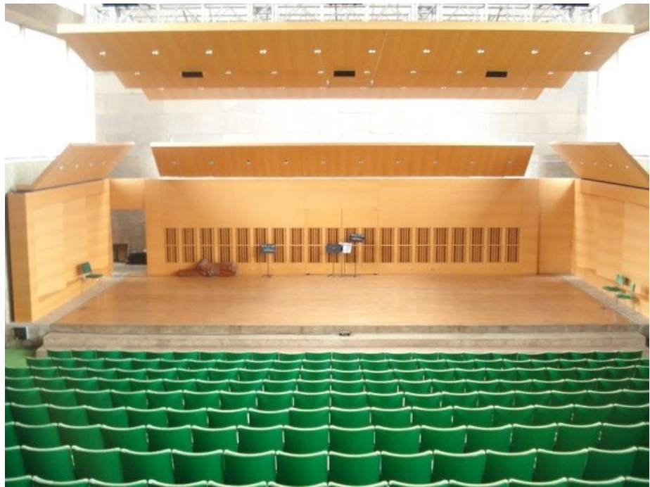
Crowell Concert Hall in the CFA. The wooden panels are recent additions to the hall that make it not only more attractive, but also much more acoustically attuned for musical performances.

The '92 Theater is a student-run theater that seats up to 100 people. On the day of our visit, student technicians were hard at work despite it being the middle of spring break. Nearby is Memorial Chapel, also home to frequent musical performances.