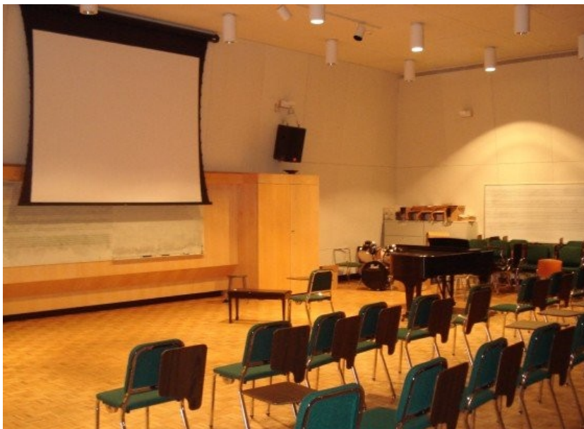
The choral room in the CFA is also used for film screenings and as a large classroom. The recording studio is right next door.