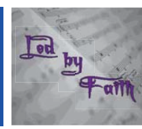
"Led By Faith" Music Ministers