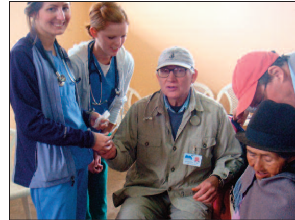
Above: On a mission, Ecuador, 2010