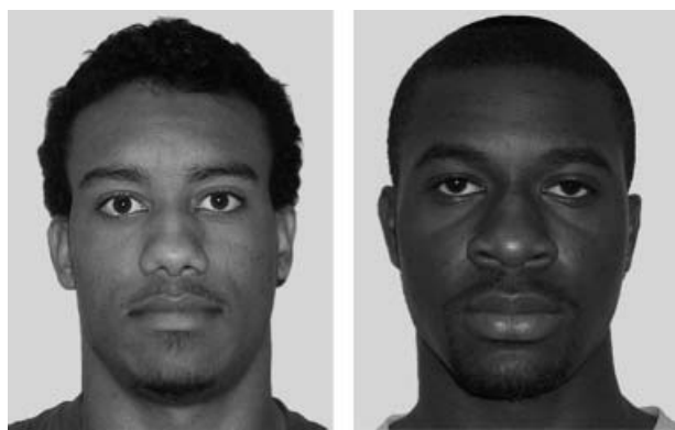
Fig. 1. Examples of variation in stereotypicality of Black faces. These images are the faces of people with no criminal history and are shown here for illustrative purposes only. The face on the right would be considered more stereotypically Black than the face on the left.

phia, Pennsylvania, that advanced to penalty phase between 1979 and 1999. Forty-four of these cases involved Black male defendants who were convicted of murdering White victims. We obtained the photographs of these Black defendants and presented all 44 of them (in a slide-show format) to naive raters who did not know that the photographs depicted convicted murderers. Raters were asked to rate the stereotypicality of each Black defendant's appearance and were told they could use any number of features (e.g., lips, nose, hair texture, skin tone) to arrive at their judgments (Fig. 1).