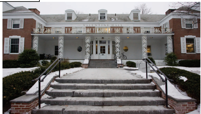
Valentine Hall/Lewis Sebring Commons

Valentine Hall is directly across from Seelye Street.