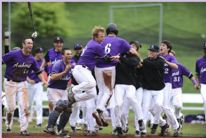
Players celebrate after beating Wesleyan in 13 innings in the 2 nd Round of the 2013 NESCAC Tournament.

To learn more about the tour go to: http://amherstbaseball.wordpress.com