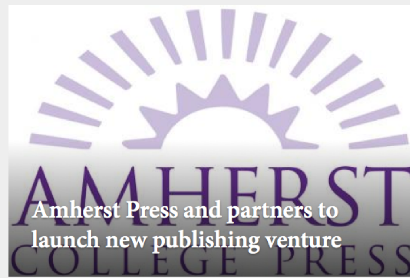
Amherst Press and partners to launch new publishing venture