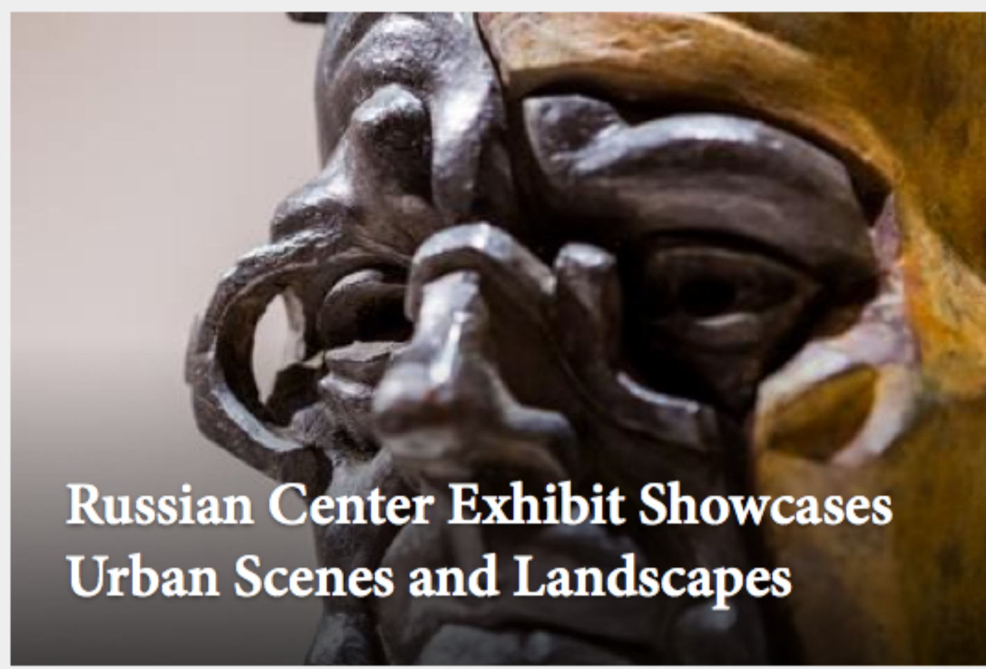
Russian Center Exhibit Showcases Urban Scenes and Landscapes