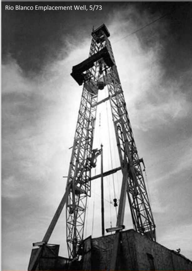
Rio Blanco Emplacement Well, 5/73