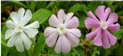
HOOD LAB: Performance of a Hybrid Fungal Pathogen on Pure-Species and Hybrid Plant Hosts