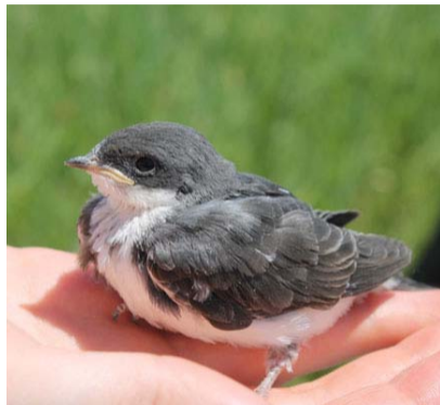
CLOTFELTER LAB: Hematophagous Parasites of Nestling Tree Swallows – Summer 2014 SURF Fellows

Please click on the images for more information.