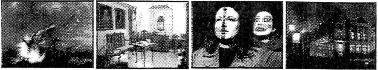
(Dutch paintings in the Kunstsammlung -- Barock room in Städtisches Museum -- On stage: Junges Theater -- The Deutsches Theater)