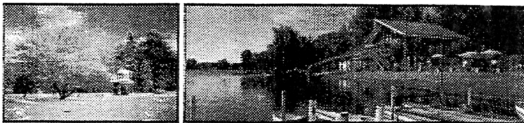
(Jerome-Pavilion on the Schillerwiese -- Recreational area in the south west of Göttingen: the Kiessee lake)