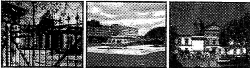
(Sternwarre (observatory ) with Gauß memorial -- University hospital -- Aula on the Wilhelmsplatz)

As far back as 1311 education was taken seriously in Göttingen. Records show that the town already had a school at that time. By 1530 it had acquired a grammar school and in 1536 the Town Council even applied to the Emperor for permission to establish a university. However, troubled times followed and the ambitious plans were laid aside. Although the town failed in its purpose then, its ambitions were fulfilled in 1734 through the generosity of the local ruler, Elector George Augustus of Hanover, who founded Göttingen University. It started with four faculties and was a true product of the Age of Enlightenment. Soon, with 800 students, it was the best-attended university in Europe. Today the university has 14 faculties and is one of Germany's leading universities with more than 32,000 students, 2,500 professors and academics and a technical and administrative staff of 7,000.