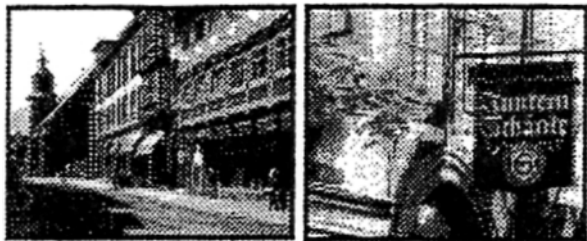
(Gron.er Tor -- Hisrorcal houses with flowers)