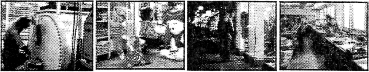
(Laser technology -- Shopping is fun -- Evening walk -- Good Tradition: optical industry)

Gottingen is also the centre of commerce and industry in southern Lower Saxony. Alongside the traditional pillars of the economy, commerce and the trades, industry now also plays an important role. This does not mean a proliferation of factory chimneys belching smoke, but a healthy mixture of industries that have little harmful effect on the environment.